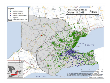
Larger image here

Hamilton: 204 raccoons, 100 skunks, 1 fox, 2 cats